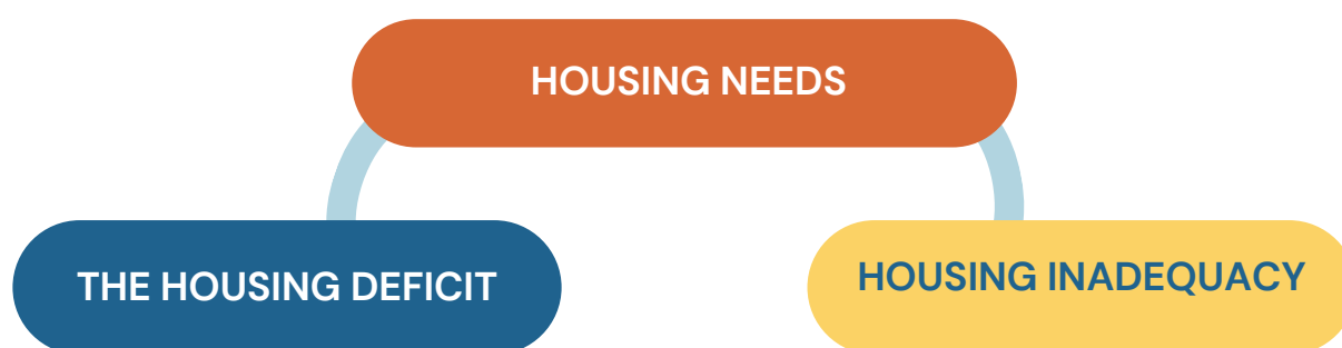
Image 1: Dimensions of the Housing Deficit and Inadequacy of Housing in Brazil

The housing problem in Brazil involves a range of access issues, including both insufficient and inadequate housing provision. For this reason, FJP's research employs a broader notion of housing needs that encompasses a quantitative dimension, the housing deficit, and a qualitative dimension, housing inadequacy. (Image 1)